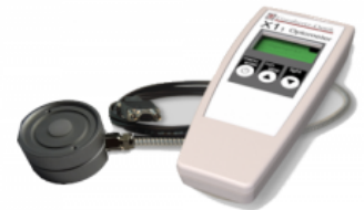
Mobile UV radiometer with separate measuring device and detector for measuring the irradiance and dose of germicidal mercury lamps.