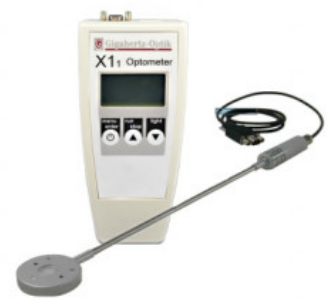
UV Curing Radiometer with a separate RCH-116-4 detector for measurement of high-power LED lamps in UV-A and blue light radiation curing

One essential quality feature of photometric devices is their precise and traceable calibration. The RCH-116-4 detector is calibrated for standard Curing LED wavelengths: 365 nm, 375 nm, 385 nm, 395 nm, 405 nm, and 430 nm . The calibration is performed by Gigahertz-Optik's ISO 17025 calibration and testing laboratory allows highest accuracy since is