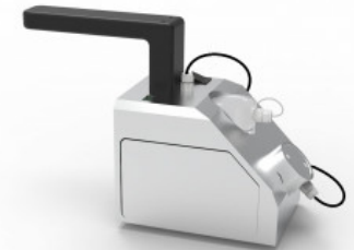
LCR-20 light source with detector

The LCR-21 is based on the same concept, but two detectors are used to perform the measurement simultaneously. In addition, both measured values can be shown on the display.