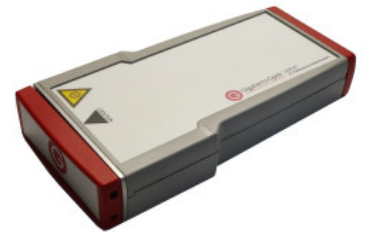
LCR-21 light source with detector